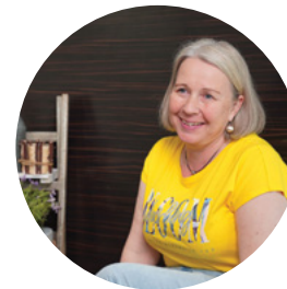
Anke lost 22 kgs

Results are from individual patient testimonials, and your results may vary. See their full stories and more at apolloendo.com/ESG .