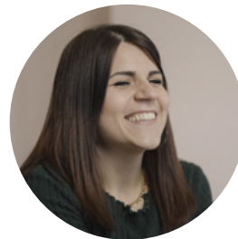
Ambra lost 35 kgs